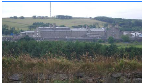
A View of Dartmoor Prison

ple that can be written to and the latest information. Please pray! Please also note that at present CBSI and