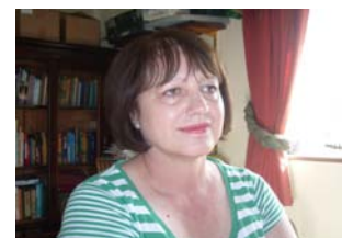
CBSI UK National Director